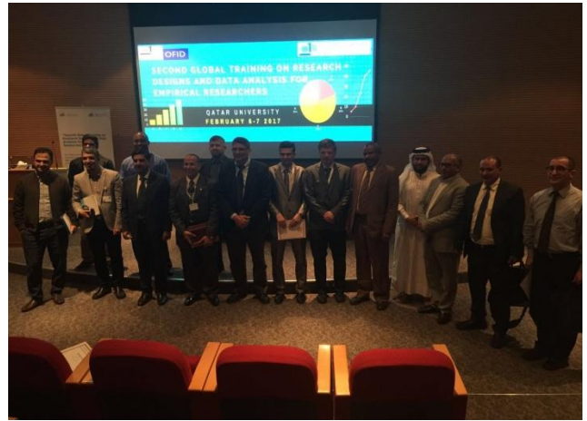
With resource persons and participants